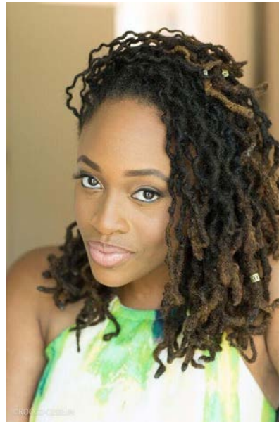
UCR Class of 2008 President, UCR Black Alumni