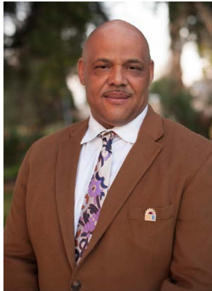
UCR Class of 1988 Chair, UCR Grier Concerned Citizens