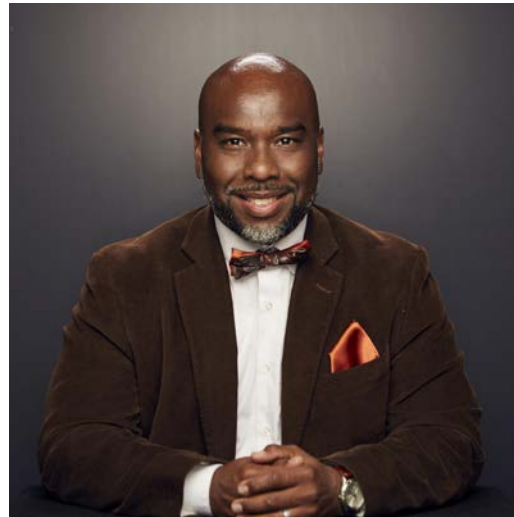
UCR Class of 1999 Past President, UCR Black Alumni